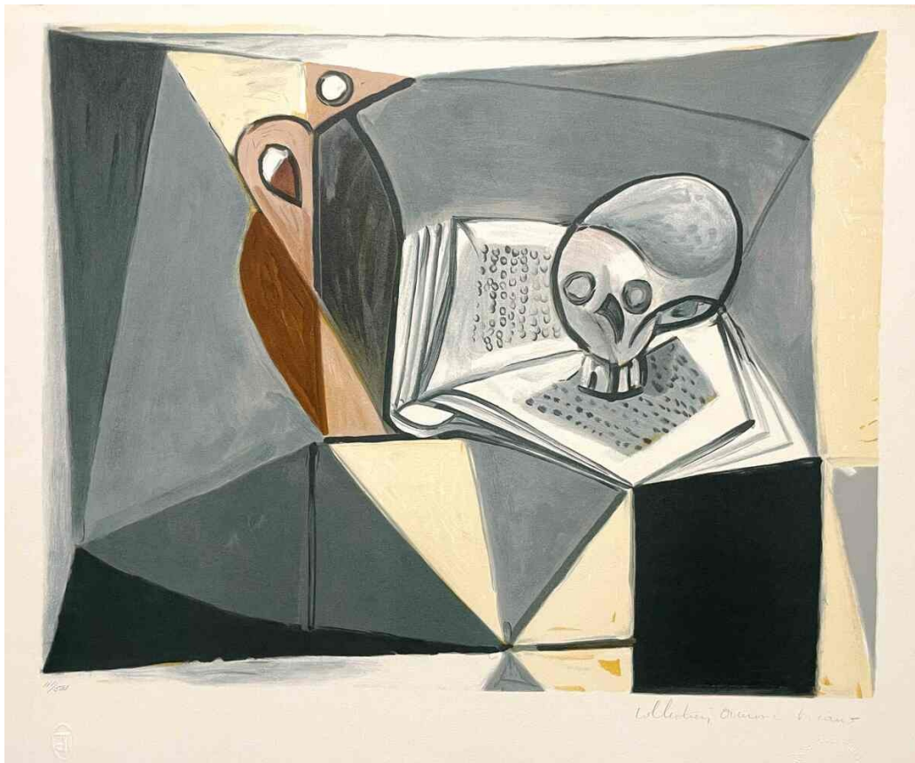
(after) Pablo Picasso (Spanish, 1881 - 1973) Tête de morte et livre, 1979-1982 Lithograph on Arches Paper 22 x 29 inches