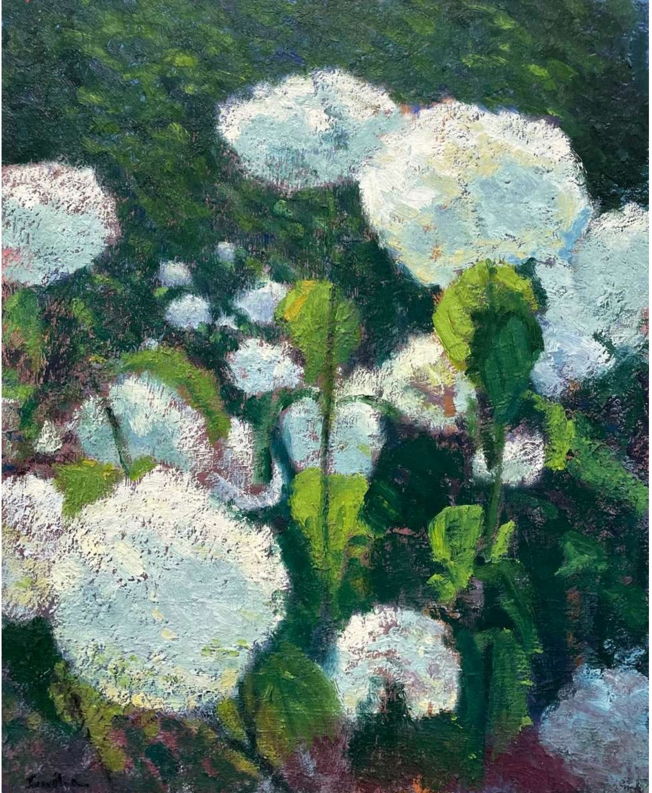
Brian Sindler (American, b. 1957) Untitled (Hydrangeas) , ca. 2010 Oil on canvas