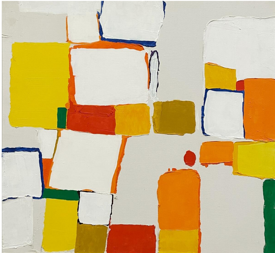
John Purpura (American, Born 1933) Some are Missing, ca. 1970 Oil on canvas 23 3/4 x 25 3/4 inches (framed 24 1/4 x 26 1/4 inches) #21290